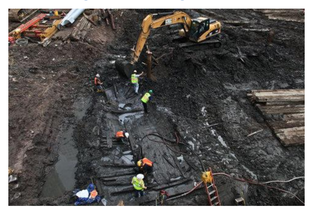
Figure 8: 18th Century ship