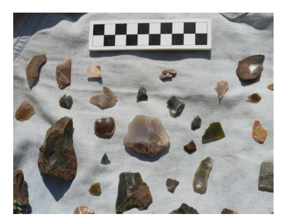
Figure 1: Stone flakes