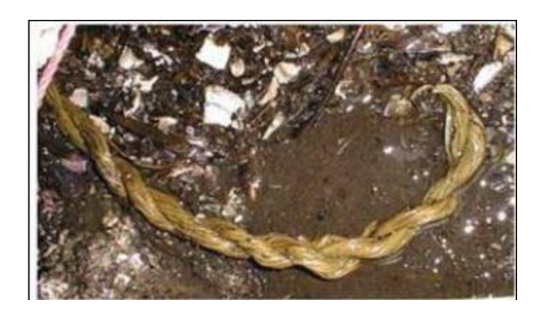
Figure 3: Cordage