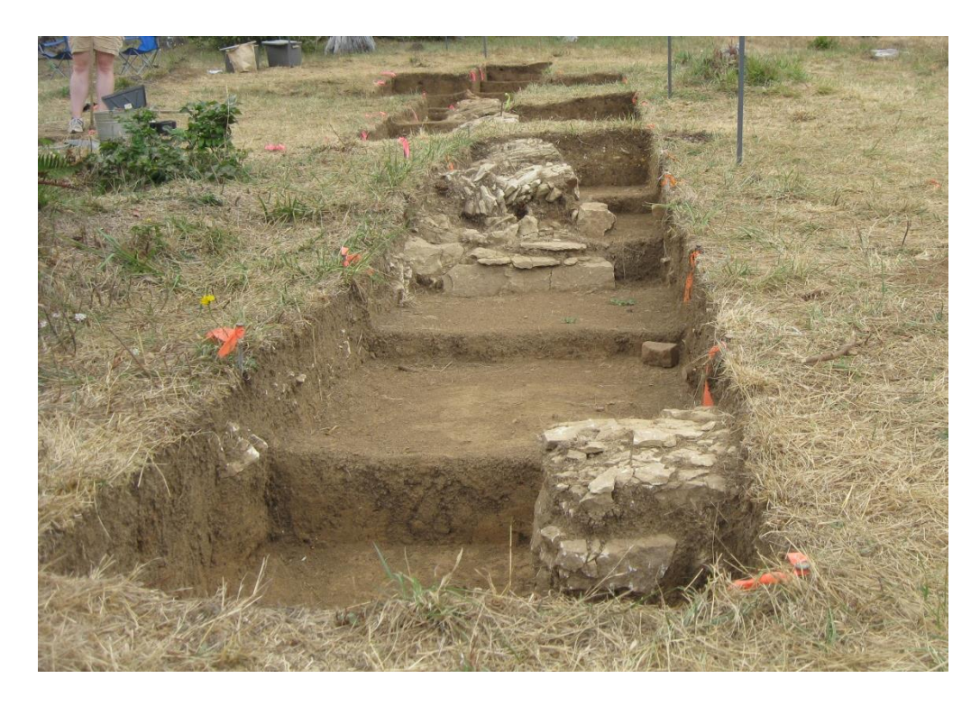
Figure 7: Historic building foundations