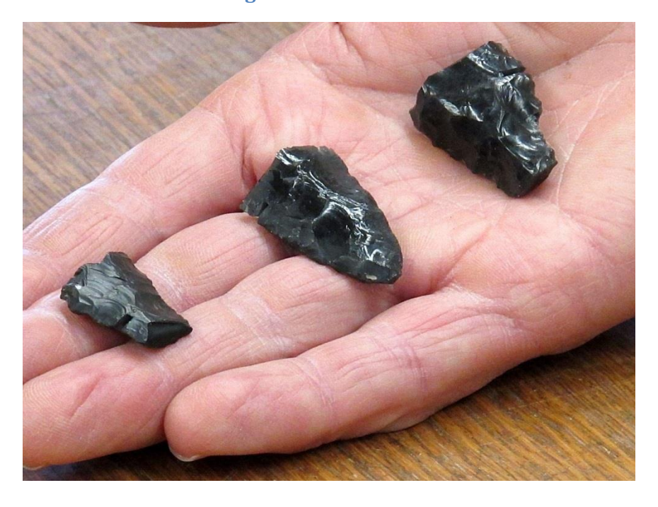
Figure 2: Stone tool fragments