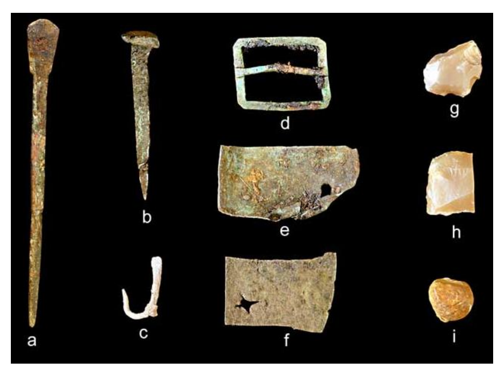
Figure 6: Historic metal artifacts