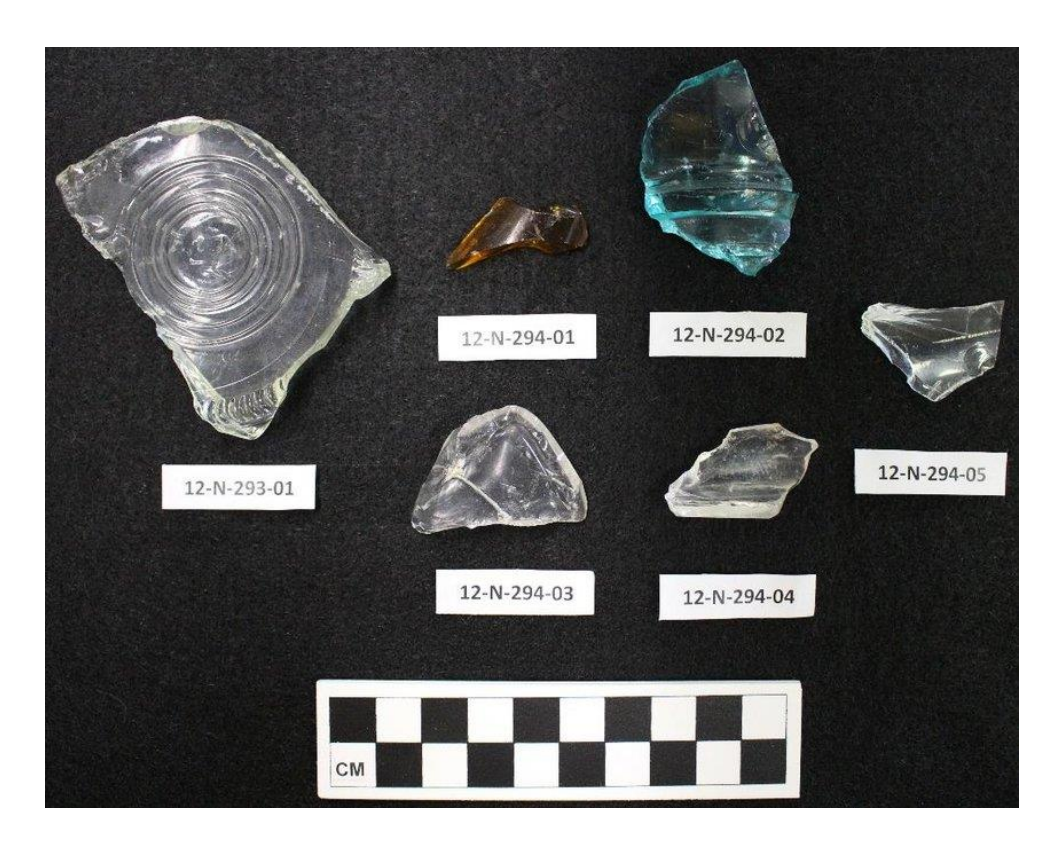
Figure 5: Historic glass artifacts