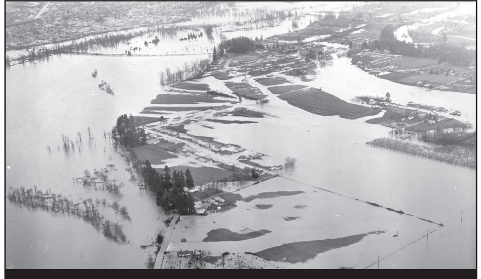
Historically, most flooding in the Albany area affects low-lying areas of North Albany near the Willamette River. The Christmas flood of 1964 was the largest flood in recent history but fell short of being a "100-year flood." The 1996 flood was considered a 13-year flood, based on regulated flow with dams upriver. Weather watchers and emergency managers in the Willamette Valley are warning of the potential for heavy flooding this winter due to the La Nina weather pattern and limited capacity at the dams.

Maintaining the flow capacity of rivers and streams requires cooperation and assistance to prevent flooding and bank erosion. Here are some suggestions and information for understanding how floodplains function and how the City regulates the floodplain to protect property and