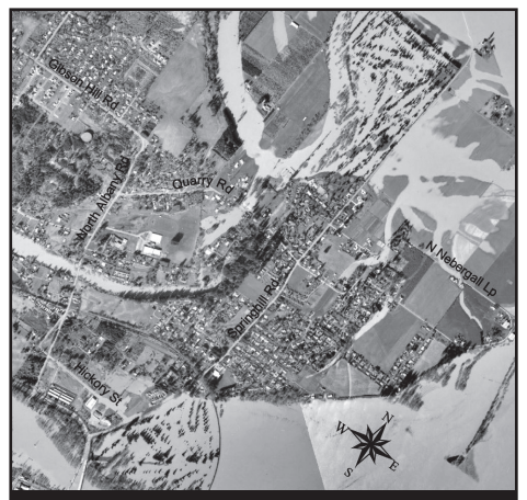
Aerial view of North Albany during the 1996 Willamette River flood.

Flood insurance protects you from the financial devastation caused by floods. If you don't have flood insurance, talk to your insurance agent. Even a few inches of water can bring thousands of dollars in