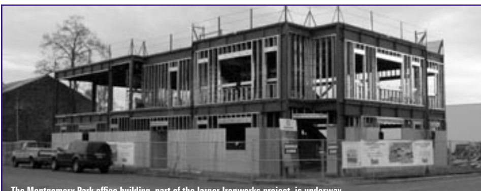
The Montgomery Park office building, part of the larger Ironworks project, is underway

The CARA Board has also administered a grant and loan program committing funds to more than 20 projects. These range from small grants for awnings or paint to upper floor renovations in downtown buildings and renovations and updates of some of Albany's most precious assets: the historic buildings in our