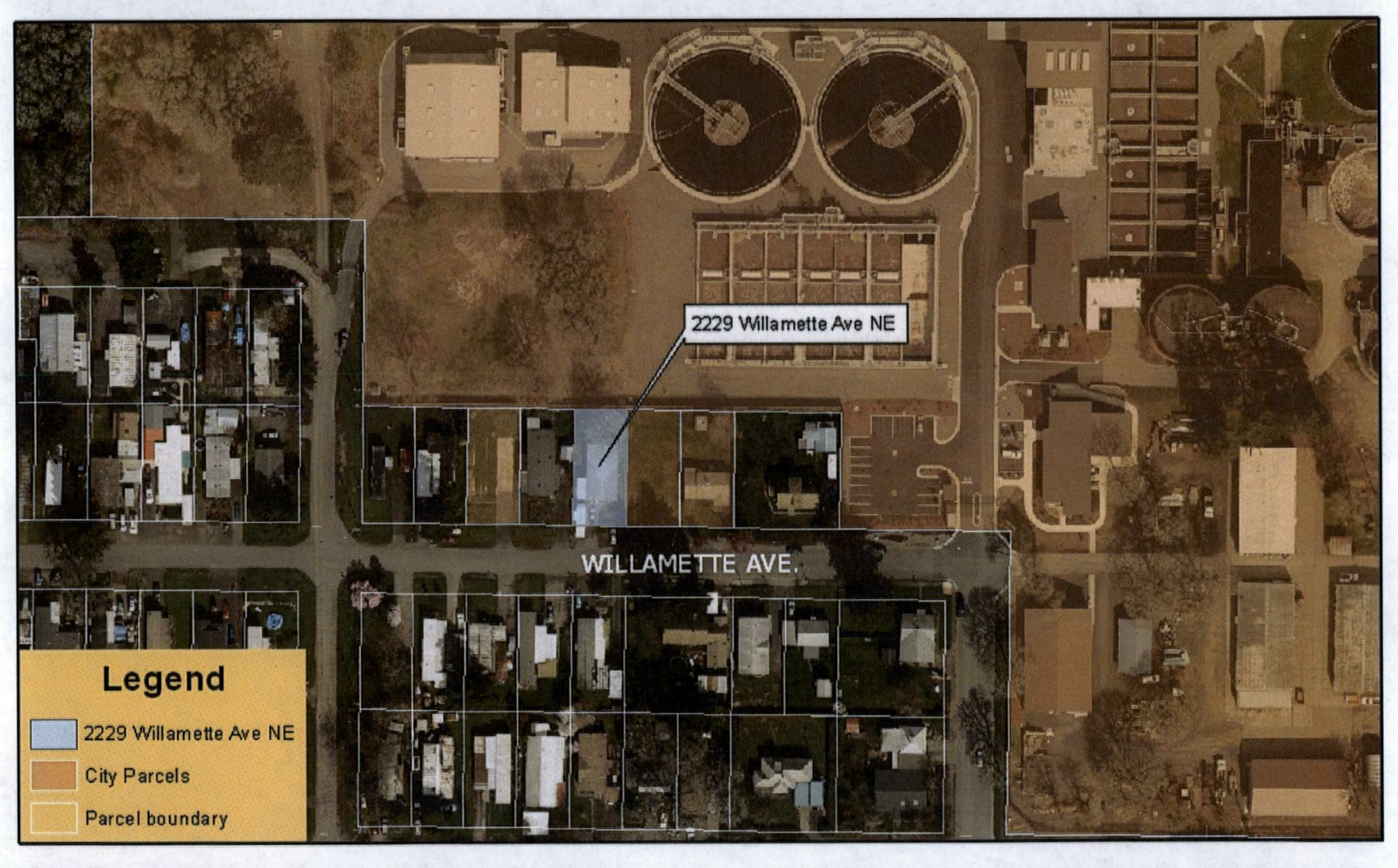
Exhibit A - 2229 Willamette Avenue NE